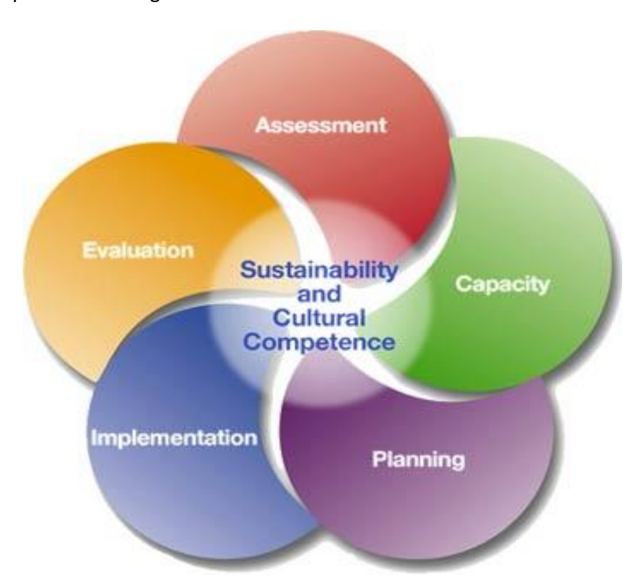
Figure 1: Five Steps of the Strategic Prevention Framework Process

The SPF represents a five-step, data driven process used to 1) assess needs; 2) build capacity; 3) engage in a strategic planning process; 4) implement a strategic plan and 5) evaluate processes and outcomes. Cultural competency and sustainability are a focus across all five SPF steps.